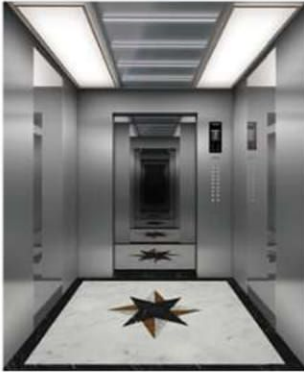
Front side view