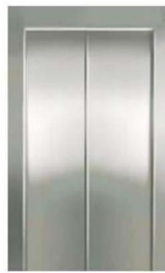
AUTOMATIC S.S DOOR