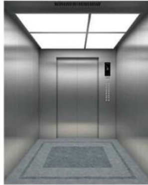
Front side view