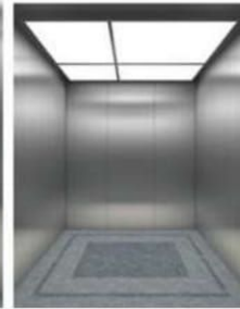
Back side view