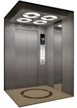
MODEL NO. CBN 1030