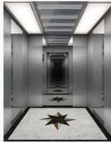
Back side view