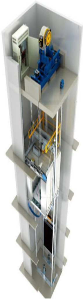
Small machine room elevator