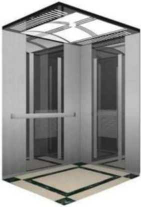
MODEL NO. CBN 1040