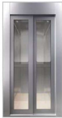
AUTOMATIC GLASS DOOR